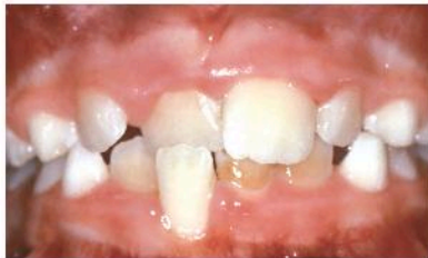
Crossbite of Front Teeth

Malocclusions (“bad bites”) like those illustrated below, may benefit from early diagnosis and referral to an orthodontic specialist for a full evaluation.