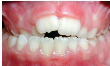
Crossbite of Back Teeth

Top teeth are to the inside of bottom teeth